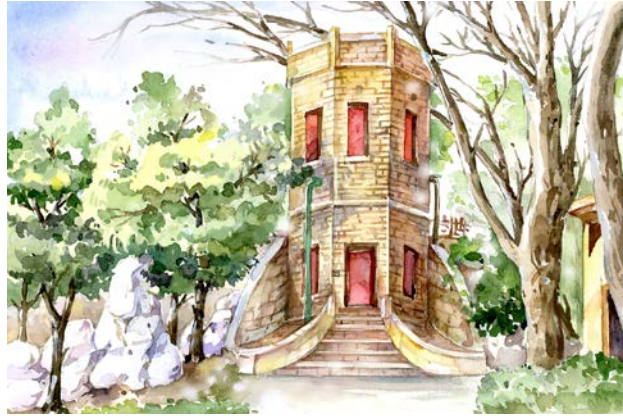
Figure 2 Interior decoration