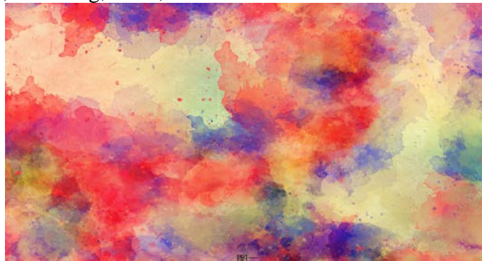
Figure 1 Interior decoration

Compared with traditional color decoration, modern watercolor decoration has unique performance characteristics. In interior design, relevant designers can start with the basic requirements of interior design, according to the decorative performance of watercolor, redefine its decorative composition, modeling, color, texture and other connotations.